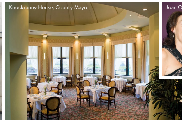
Knockranny House, County Mayo