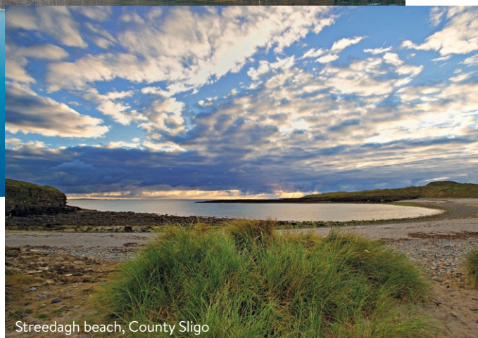
Streedagh beach, County Sligo