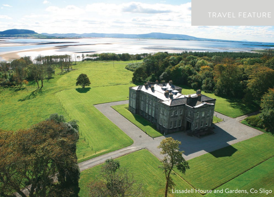
Lissadell House and Gardens, Co Sligo