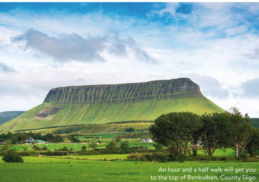
An hour and a half walk will get you to the top of Benbulbin, County Sligo

the remotest part of Leitrim and my family are scattered throughout Aghanlish, Largydonnell and Fertagh with the family farm still in the Glenade Valley, one of the finest glacial valleys in Ireland, nestled at the base of the Dartry Mountains. An aunt and uncle settled in Kinlough where they ran a local shop; I have cousins nearby at the base of Benbulbin and my aunt, since departed, went into the closed order at the convent in Rossinver. This is Ireland untouched.