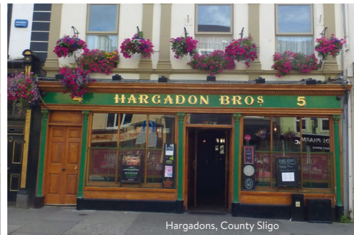
Hargadons, County Sligo