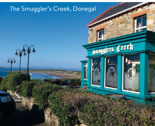
The Smuggler's Creek, Donegal