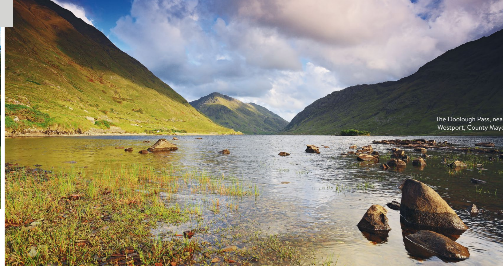
The Doolough Pass, near Westport, County Mayo