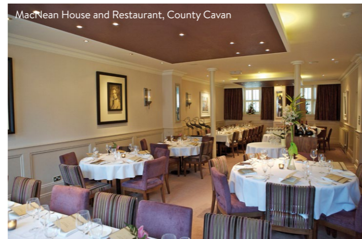
MacNean House and Restaurant, County Cavan